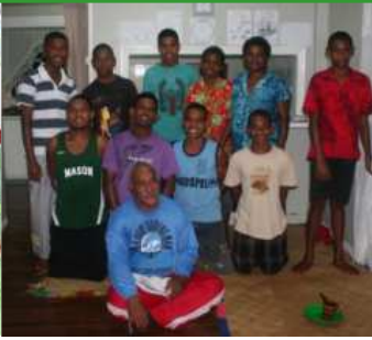
Junior Boys Hostel