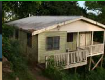
Head Teacher's House