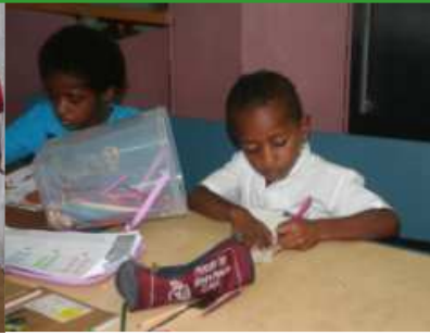
After school activity