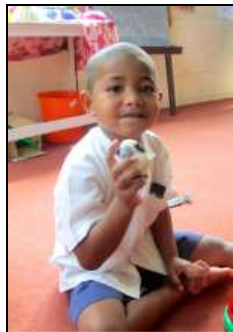
Atu - age 3

We now have a good sized kindergarten class with all our little ones – they have a sleep in the afternoon too!